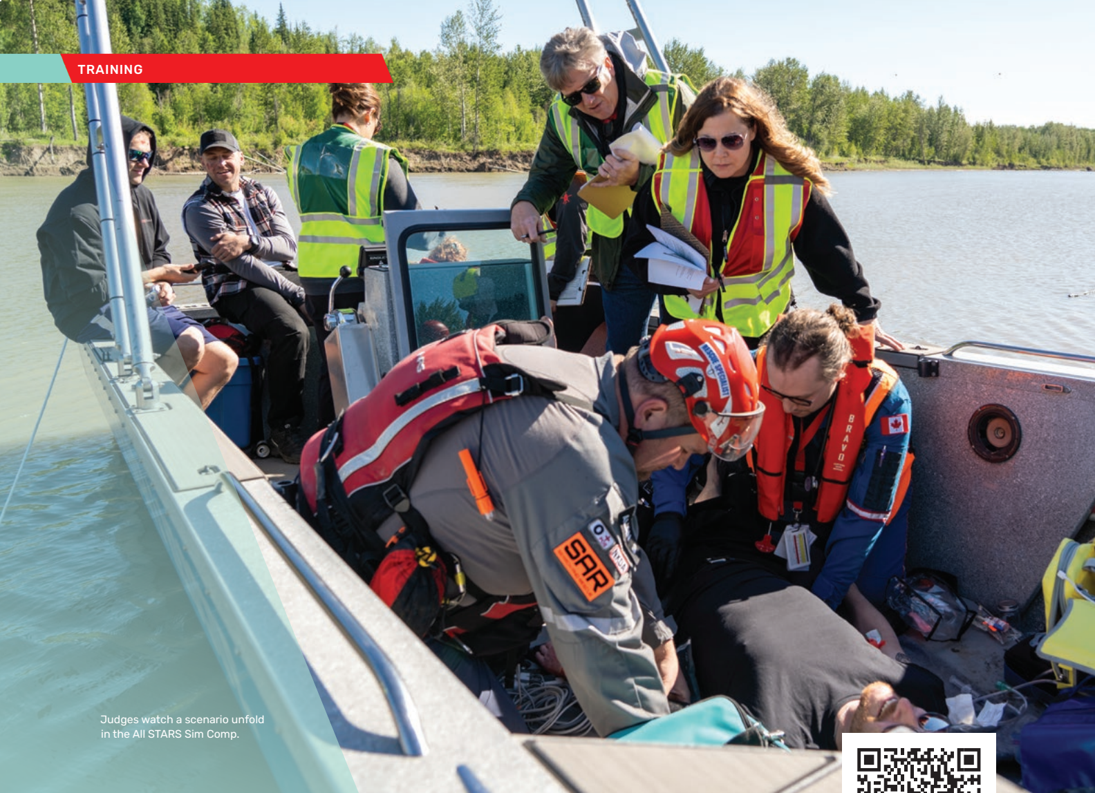
Judges watch a scenario unfold in the All STARS Sim Comp.