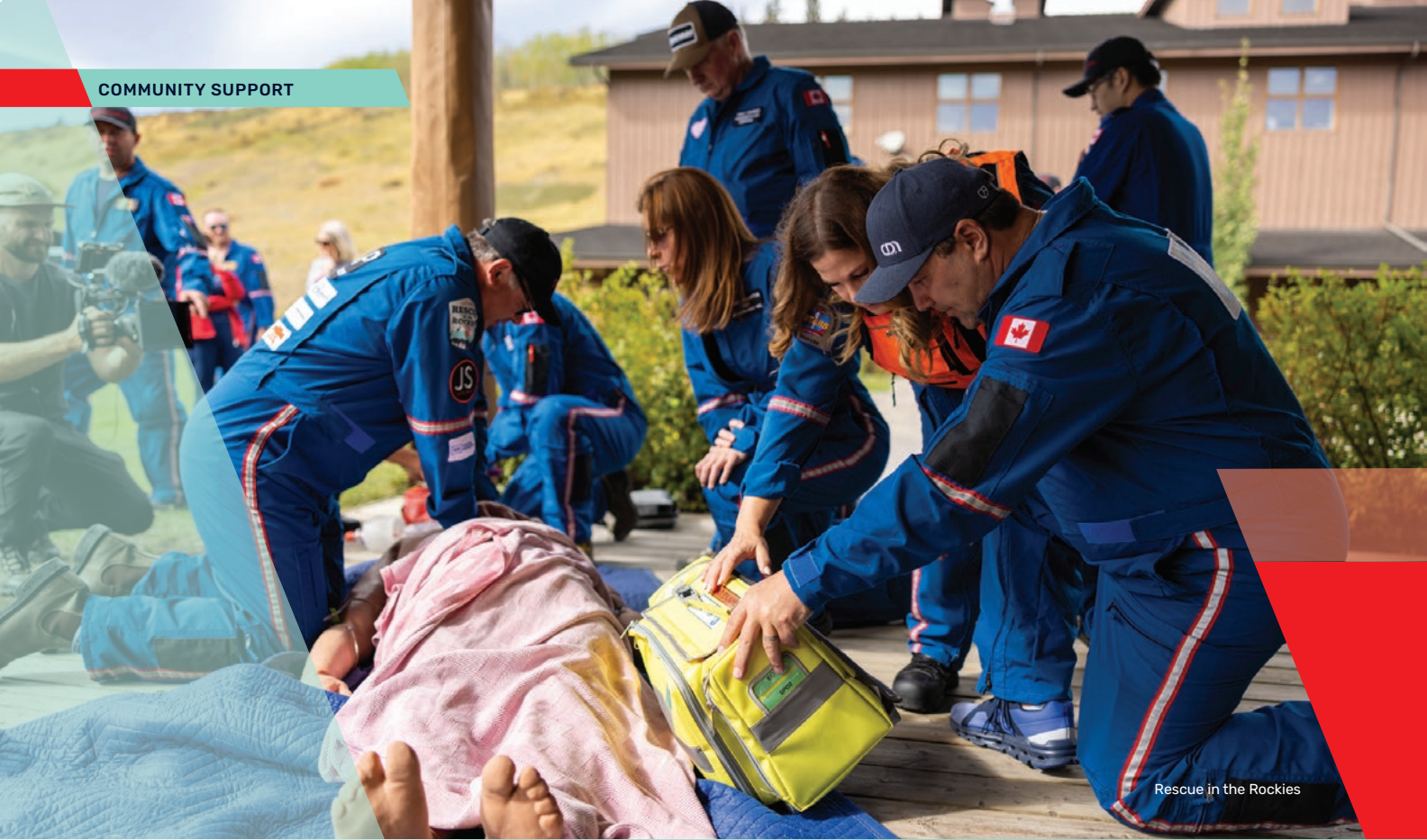
Rescue in the Rockies