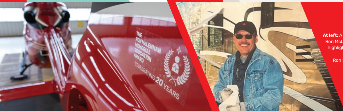
At left: A decal celebrating the donors of the Ron McLennan Memorial Education Award highlights the fenestron of a STARS helicopter.