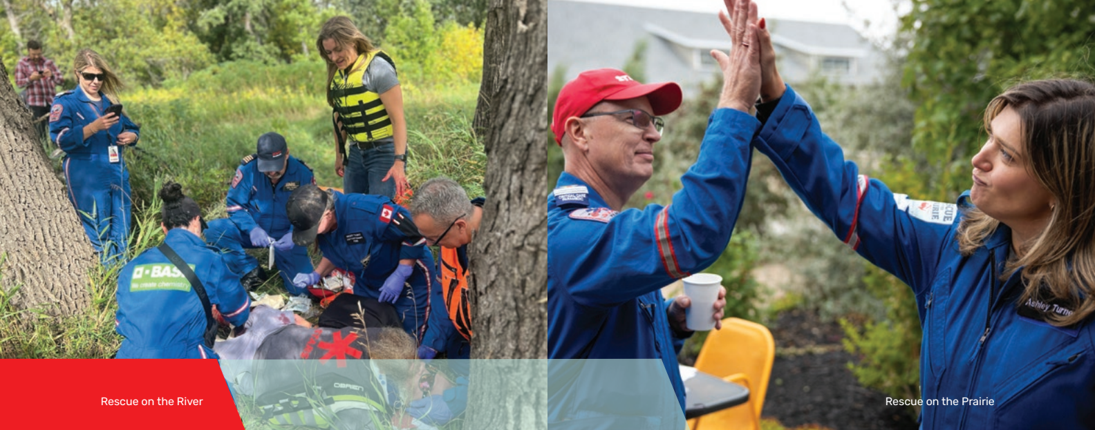
Rescue on the River